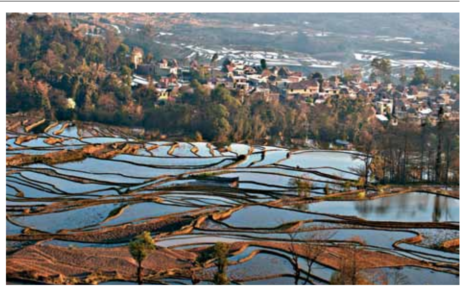
Terrace farming, Qinkuo, Yunnan, China

By exposing students to global Business Process Outsourcing (BPO) they also become more aware of globalization. In one documentary film, 1-800-India , students witness the power of digital technology that has made global BPO boom within a single decade, from an industry with no profits to an industry with a trillion dollars in profits. Students' responses to the documentary have been very strong and impressive: "Through watching 1-800-India , you can see globalization coming to life right before your eyes;" "The movie 1-800-India was a very insightful movie.