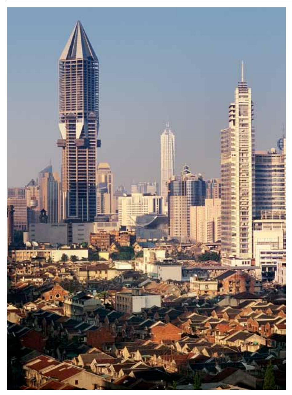
Old and New Shanghai, China

From their experience watching Mardi Gras: Made in China , students learned three important lessons: first, when the world is changing, no existing ideology can be used as a basis for judging change, reality and practice must be the sole criteria; second, rejecting the influence of ideology is key to globalizing ourselves; third, escaping the assumptions of our own culture is the beginning of opening our minds to other parts of the world.